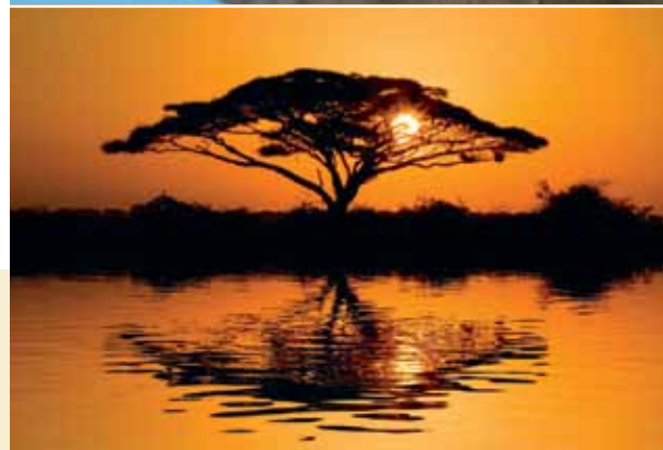
▲ Above: Hippopotamuses love water, which is why the Greeks named them the “river horse.” Below: The acacia tree is prolific throughout Africa.