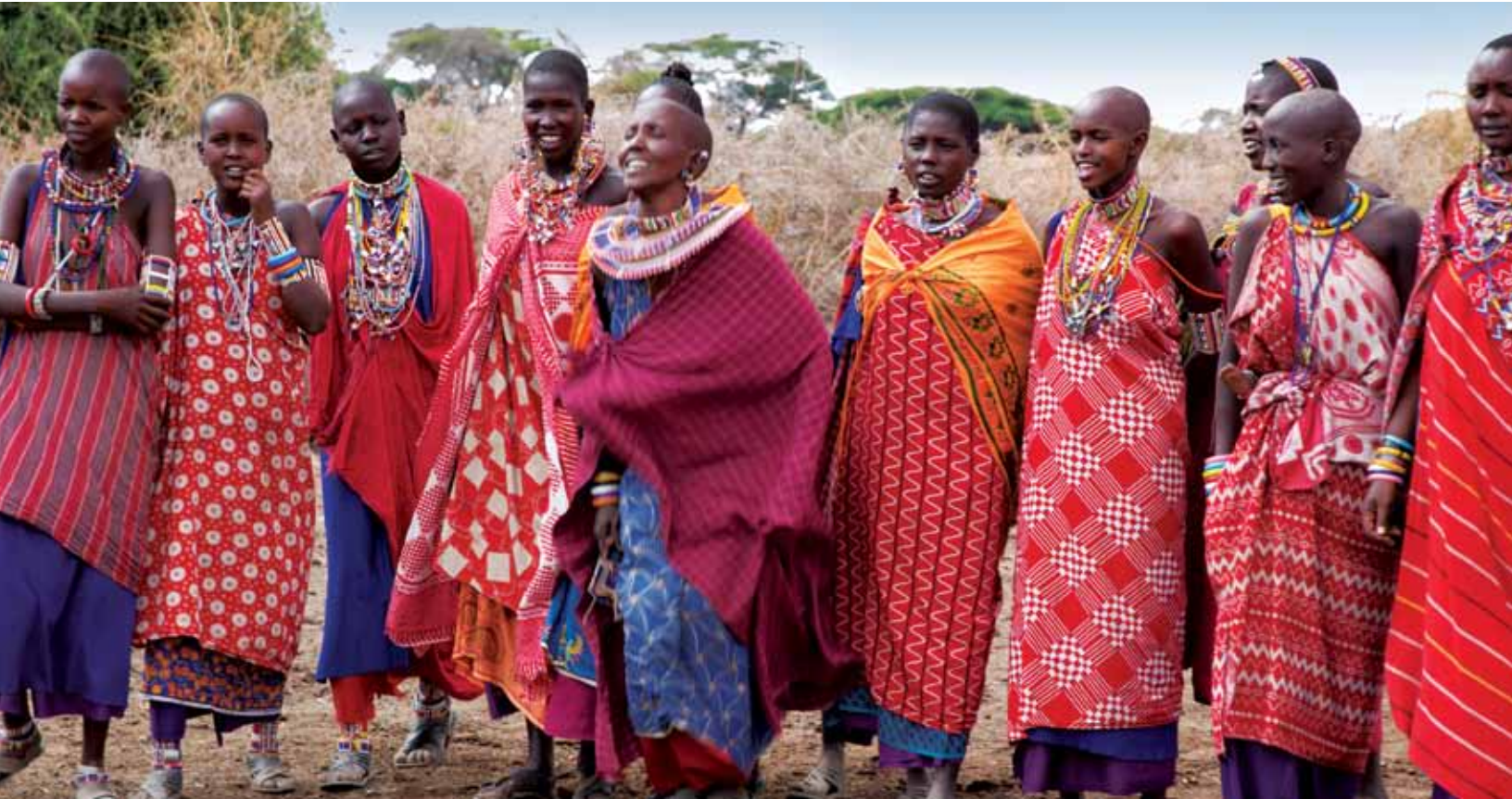
▲ Maasai women gathered for ritual celebration.