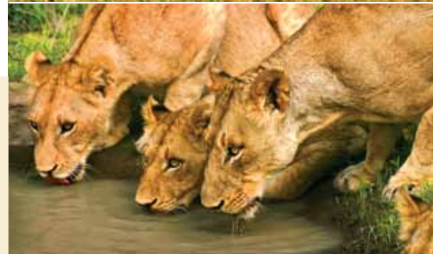
▲ Top: Elephants move past an imposing view of Mount Kilimanjaro. Middle: Curious Zebra grazing. Bottom: A lion can go five to six days without drinking.