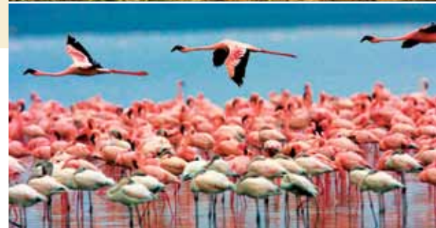
▲ Top: The Daphne Sheldrick Elephant Orphanage boasts an impressive record for saving elephants. Middle: A rare bat eared fox sighting. Bottom: Flamingos, Lake Nakuru. Photo opportunities abound.