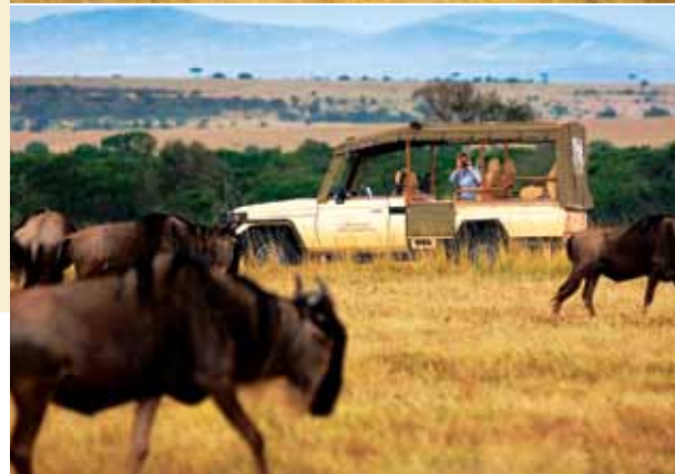
▲ Top: Elephants eat as much as 300 pounds of browse per day. Bottom: 4x4 Safari vehicle in Kenya.