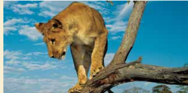
▲ Top: Ready for an early game drive. Bottom: Manyara National Park is renowned for its tree climbing lions.