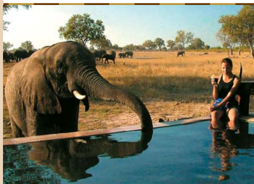
▲ There are over 40,000 muscles and tendons in an elephant’s trunk