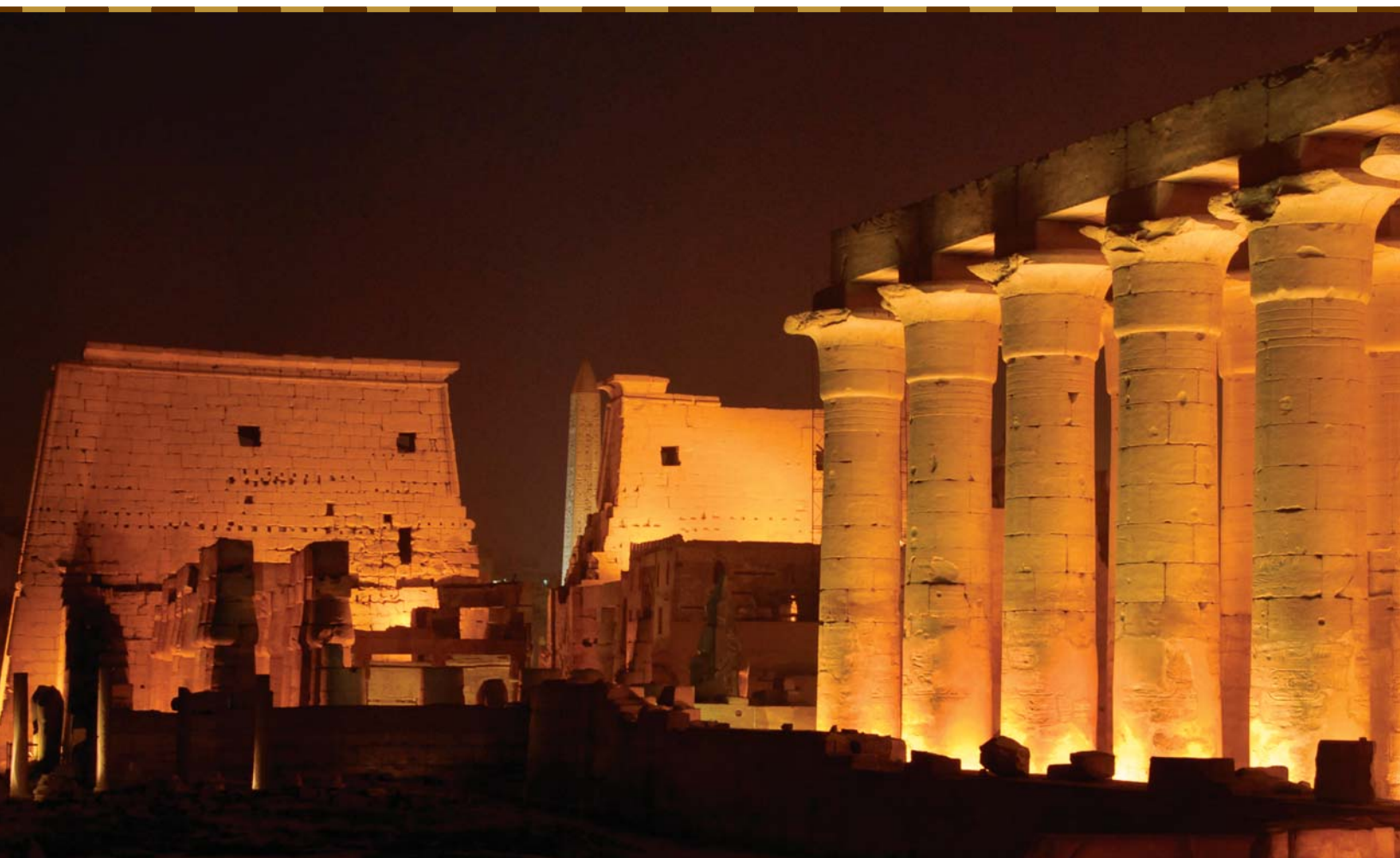
▲ Illuminated Temple of Luxor at night