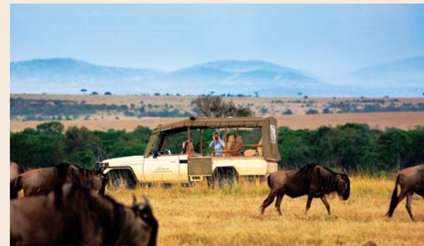
▼ 4x4 Safari vehicle in Kenya