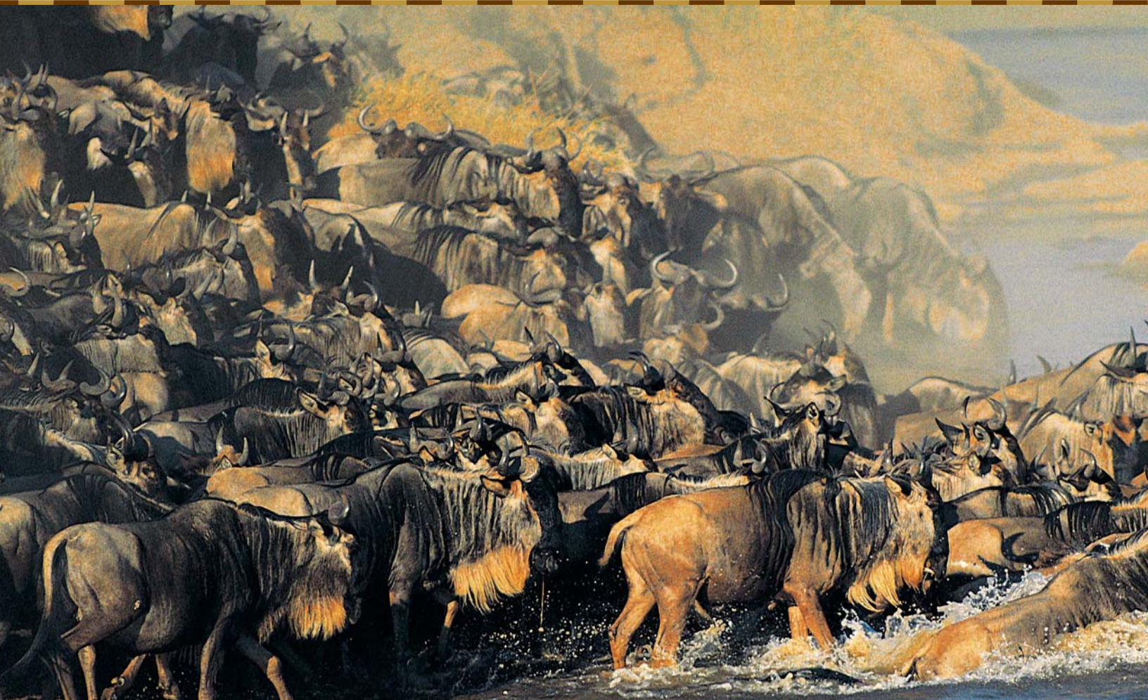
▲ Wildebeest migration, Serengeti