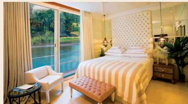
▼ Top: Suite on the River Tosca Nile cruise ship Bottom: First Pylon and Avenue of the Sphinxes, Karnak Temple