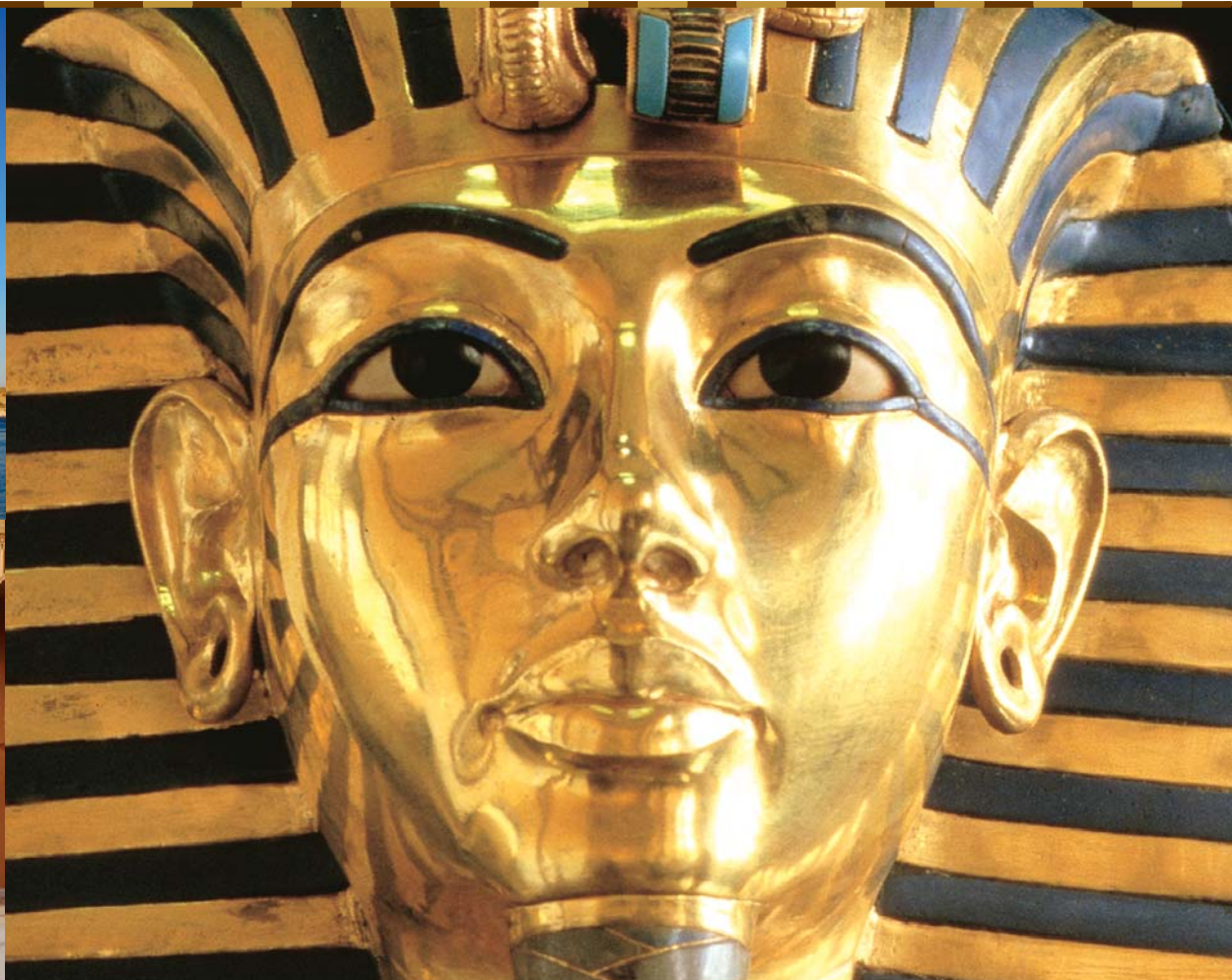
▲ Top Left: Felucca on the Nile Lower Left: Empress Eugenie Palace, now a Cairo hotel Above: Golden mask of King Tutankhamun