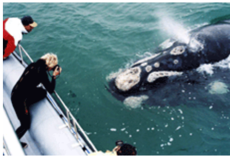
Boat based whale watching in South Africa