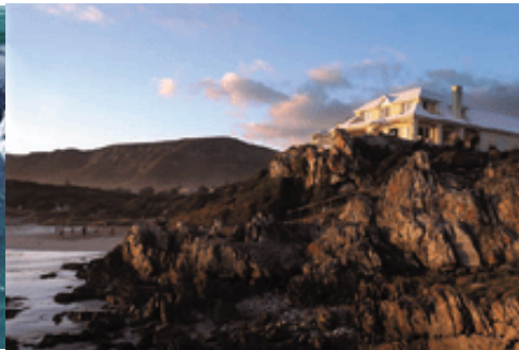
Birkenhead House, Hermanus, South Africa

Request a catalog from African Travel Inc.