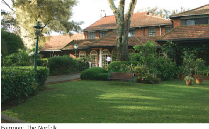
Fairmont The Norfolk