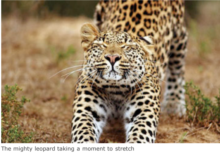
The mighty leopard taking a moment to stretch

Of all the properties that Fairmont acquired, the Mount Kenya Safari Club has endured the most extensive refurbishment. The finish carpenters are expected to depart at the end of 2008, so by the New Year, the resort will be re-open to first-time visitors as well as guests that have called this property their 'vacation home' for decades. The Mount Kenya Safari Club is set on 100 acres of beautifully manicured grounds, where peacocks and warthog roam freely, and guests are invited to explore this rolling expanse on horseback. Picturesquely placed at the foot of Mount Kenya, it is the perfect setting for visitors who want a little 'pampering' in between time spent on safari and in the bush. Activities and facilities include a golf course, swimming pool, tennis courts, bowling, horseback riding, animal orphanage, and hiking trips on Mt. Kenya. There are over 115 luxuriously appointed guest rooms, including our favorite: the William Holden Suite, named after the club's famous founder.