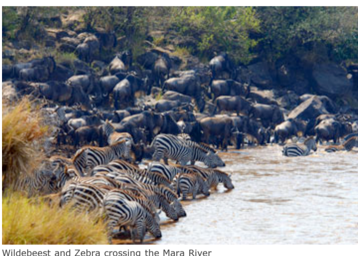
Wildebeest and Zebra crossing the Mara River

The prestigious Fairmont Hotel group has bought several high-profile Kenyan hotels and safari lodges that were previously under the Lonrho banner. The Norfolk Hotel — one of Africa's most famous landmarks — has nearly completed its refurbishment and serious makeover. This 100 year old property is looking better than ever! The beautiful guest rooms and public areas are freshly elegant, retaining the warmth and historic touches of a bygone era. The inner courtyards are a welcome respite from the busy city streets, and guests are invited to enjoy the gardens or a swim in the lovely new pool. The outdoor dining patio, however, has not been changed. It is said that the ghosts of Hemingway, Churchill and Denys Finch Hatton still enjoy lunch here on Lord Delamere Terrace, toasting each other with mugs of cold Tusker beer and watching luminaries arrive and depart through the hotel's bustling portal.