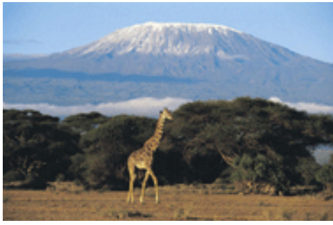
Mt. Kilimanjaro, Tanzania