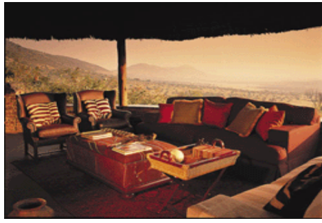
Klein's Camp, Serengeti, Tanzania