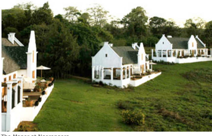
The Manor at Ngorongoro

This small park is sandwiched between the Rift Valley escarpment and the large sodiferous Lake Manyara. Travelers driving from Arusha to Tanzania's major game parks often stop here for a night or two. Or even just for lunch and a swing through the pretty park. Manyara has a good range of game, including birdlife on the lake, giraffe, elephant, baboon and the tree-climbing lion. Well, okay: the rarely seen tree-climbing lion. But what fun to give it a try! It is not rare to see a safari vehicle full of anxious guests, all with faces upturned and necks craning in hopes of glimpsing a tawny hide way up in the trees. LAKE MANYARA SERENA LODGE is a popular and conveniently located lodge that caters to both individuals and groups. It wears 5 stars... but its largish size and reasonable tariff feels more like 4.