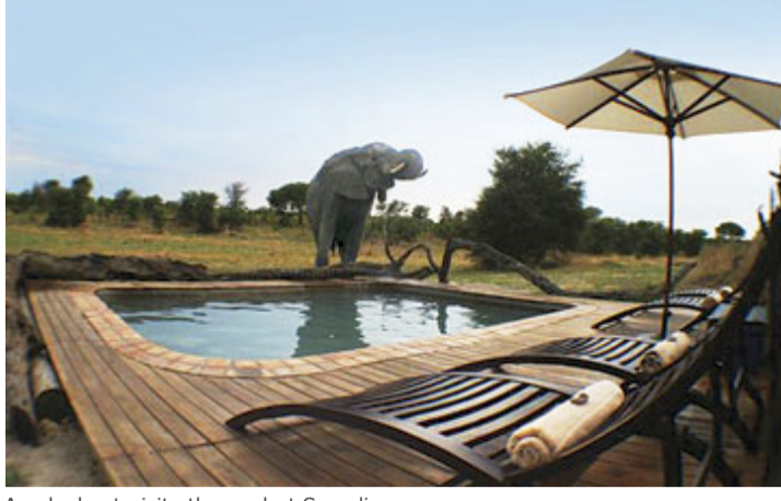
An elephant visits the pool at Somalisa