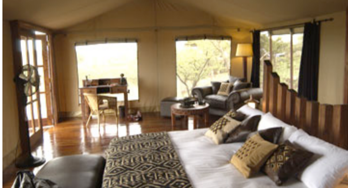
Serengeti Migration Camp

Nowhere on earth can this location be replicated. Visitors descend into the caldera floor - and step right into a fairytale locale. The sprawling 'bowl' is home to a permanent population of wildlife, who spend their entire life cycle inside the crater, finding all the sustenance they need within this self-contained ecosystem. Up top, there are several lodges near or on the crater rim, and one of our favorite picks is THE MANOR AT NGORONGORO. This lovely property is reminiscent of an elegant, upcountry farm house in the Cape Dutch style of architecture. With only 20 luxurious cottage suites, the property offers a warm and intimate home base. While a visit to the crater is a 'must' on any Tanzania itinerary, environmental experts are only now understanding the fragile nature of the craters unique ecosystem. Officials are seriously considering limiting the number of visitors allowed into the crater each day. So be it: Ngorongoro is a gift that we need to bequeath to our great-grandchildren and the generations beyond.