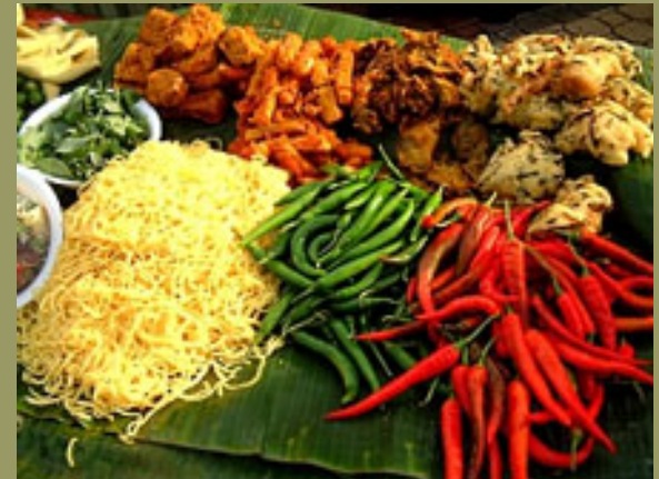
Cape Malay local cuisine

Trade Event, Vacation.com International Supplier Conference & Trade Show, Las Vegas, NV.