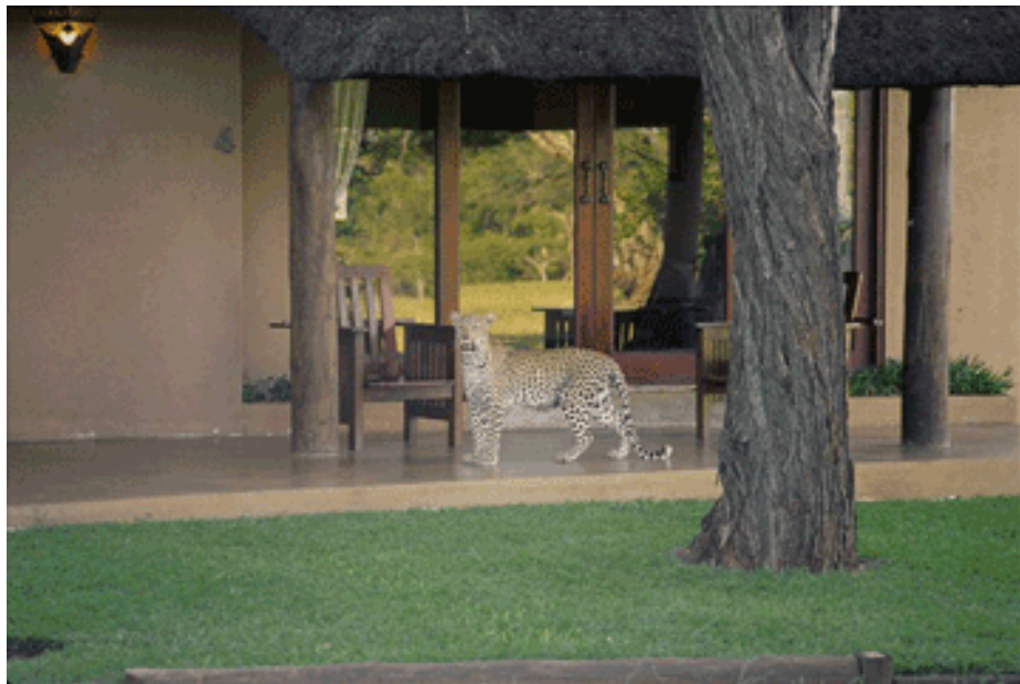
A surprise visitor at Kings Camp

Just south, Kings Camp sister property, Leopard Hills Lodge, is located in the famous Sabi Sands area. The 8 guest chalets are hilltop positioned to ensure maximum views. The spacious guest rooms include a comfy sitting area, indoor and outdoor showers and extra touches like a full stocked minibar, overhead fan and romantic bathrooms with double vanities. Outside, the large decks offer private plunge pools from which you can actually view herds of elephant meandering below... or perhaps a distant leopard on the hunt!