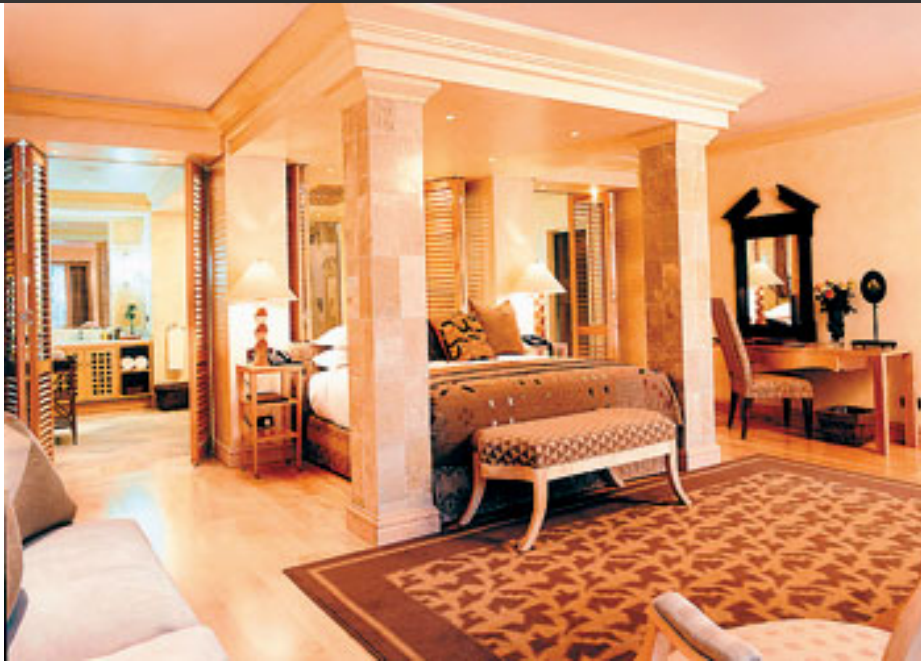
The Saxon, Johannesburg

Where? Daily non-stop service from New York and Houston to Dubai.