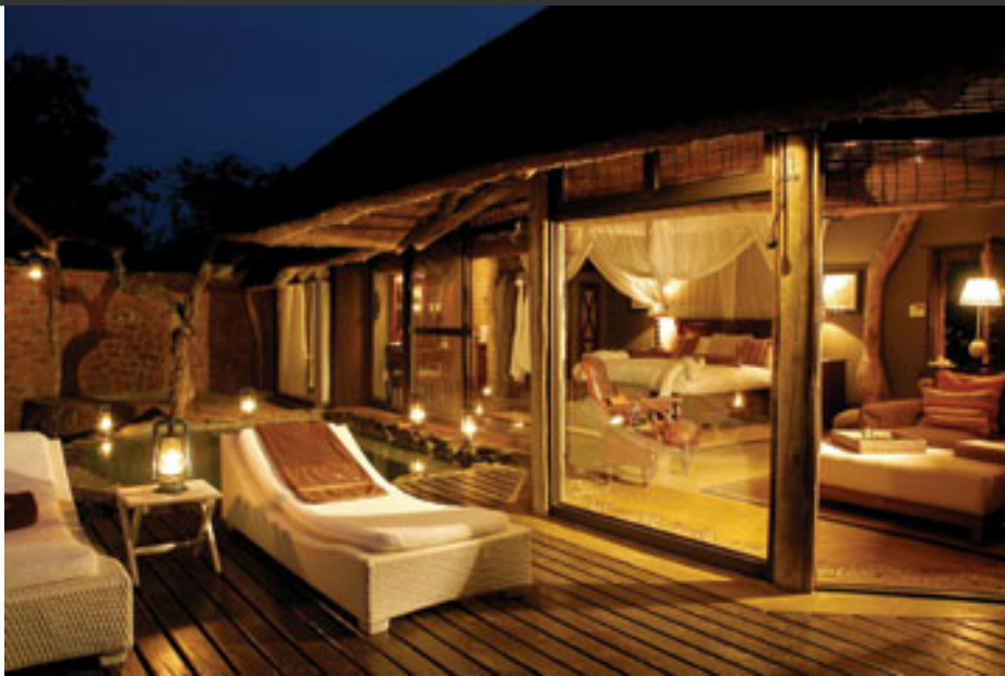
The intimate setting of a Leopard Hills Lodge chalet and outdoor plunge pool