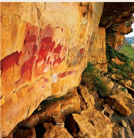
▼ Ancient rock art in Damaraland

excursion to Walvis Bay focuses on the large natural lagoon and its abundant birdlife.