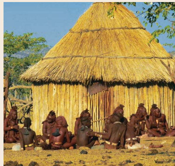
▼ A Himba village