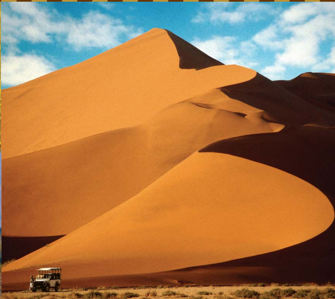
▲ Sossusvlei Dunes, Namibia - largest in the world