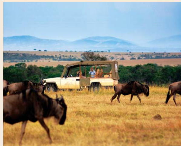
▼ 4x4 Safari vehicle in Kenya